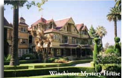
Winchester Mystery House

the heritage of Santa Clara Valley and the Bay Area. Sparkling lights dance off of priceless art glass windows. Garlands, wreaths and candles grace the mantels of 13 fireplaces. The gardens and gables are aglow with thousands of twinkling lights and music fills the air and lifts the spirits. Returning to South San Francisco we'll tour a Christmas decorations factory that creates custom seasonal décor for shopping centers, amusement parks, hotels and casino. This is a truly unique behind-the-scenes experience. This evening enjoy included dinner at San Francisco's Basque Cultural Center . (Dinner)