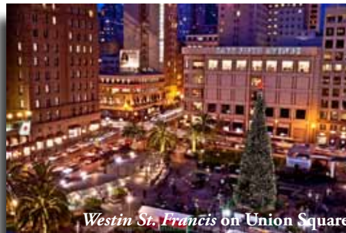
Westin St. Francis on Union Square

we’ll be joined by a local guide for a narrated driving tour of San Francisco to see all of the sights and neighborhoods that have made this city so famous and so endearing. The beautiful city by the bay, wins awards year after year as the “world’s favorite city” – from the cultural arts to intriguing architecture and diverse neighborhoods –we’ll discover why on our tour this morning. We’ll travel through North Beach , the Financial District , Golden Gate Park and see Nob Hill , Lombard Street , Coit Tower , the Victorian homes known as the “ Painted Ladies ”, Fisherman’s Wharf and much more – all decorated for the holidays! We’ll cross the iconic Golden Gate Bridge for the Marine Headlands to get magnificent views of the San Francisco skyline. An inspiring experience awaits you this afternoon at one of San Francisco’s most treasured historic hotel. Enjoy an included afternoon tea lunch at the Palace Hotel’s Garden Court , one of the most beautiful settings for dining and holiday events in San Francisco. Since the early 1900’s, guests have been enjoying elegant tea in the Garden Court – a truly magical experience that will immerse you in the romance and charm of the hotel’s turn-of-the-century grandeur and heritage. Fine china and silver service present delicate tea sandwiches, homemade scones, Devonshire cream, lemon curd